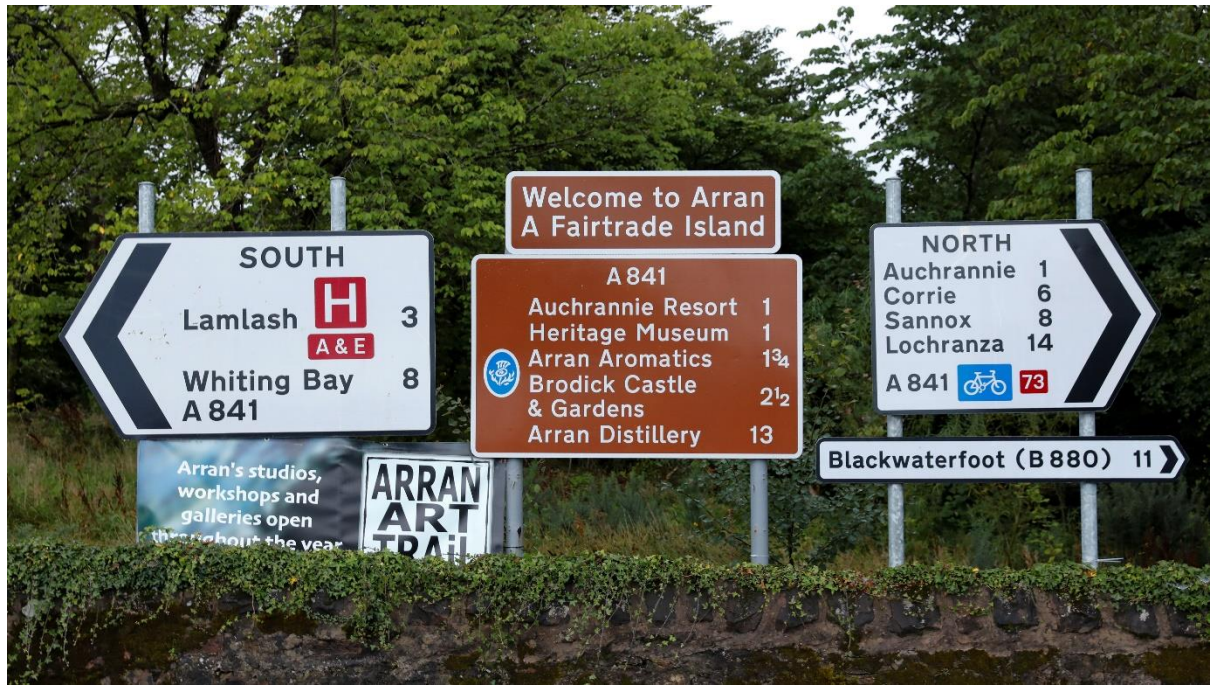
Which Way Now?