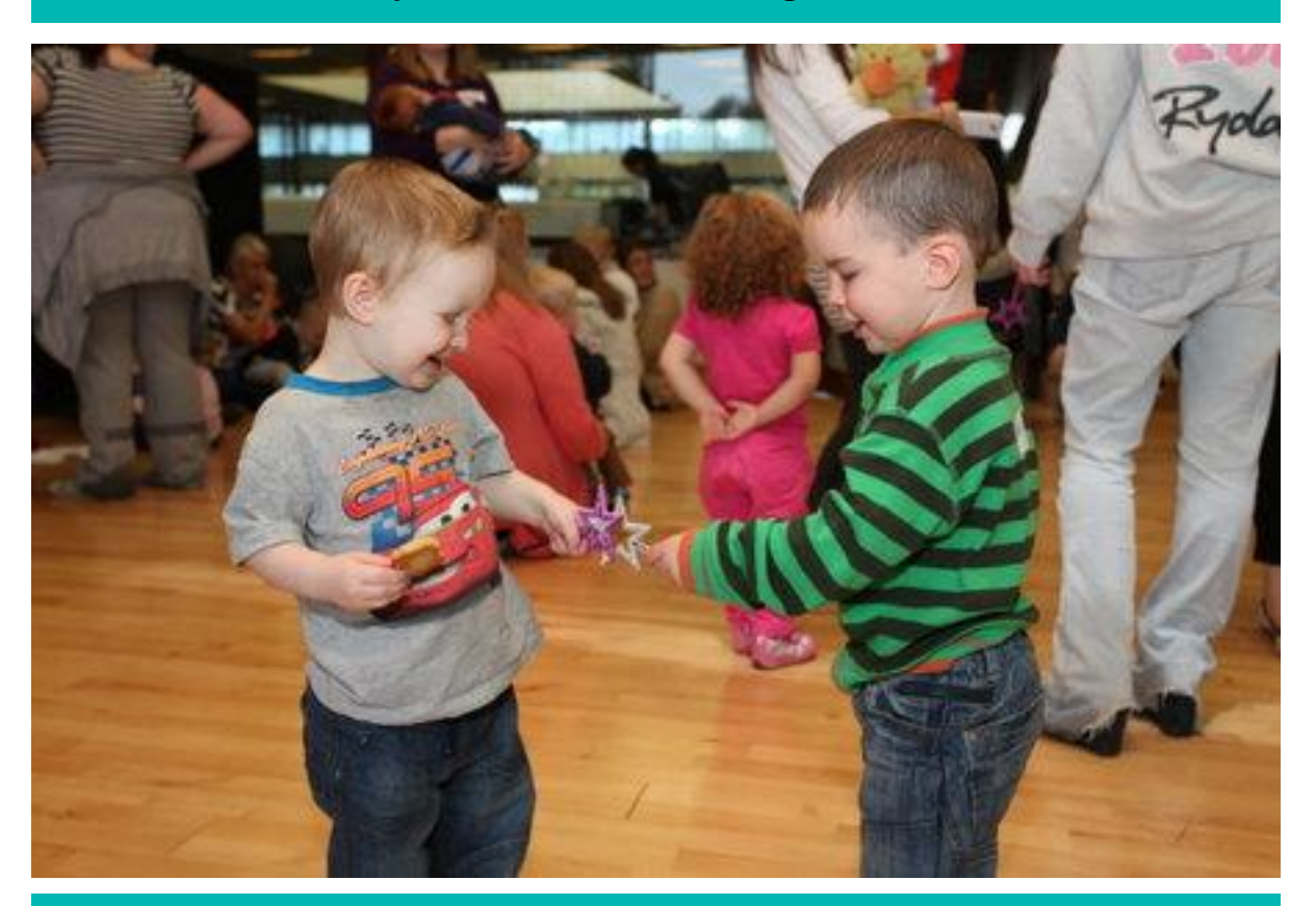
Family Nurse Partnership Graduation Event