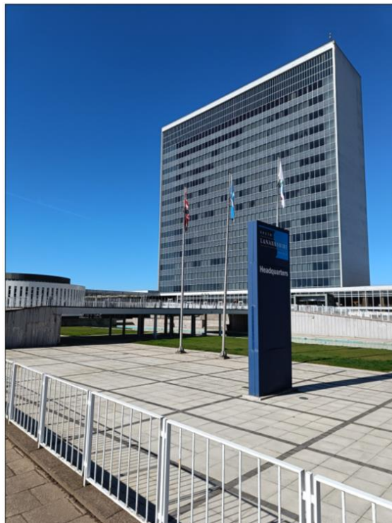
Figure 15. South Lanarkshire Council HQ Building (© Calum Robertson, Zero Waste Scotland)

Proposed heat network centred around the council headquarters, and investigating the connection of several other non-domestic public sector properties, tower blocks and proposed new-build housing in the area. Ground source heat pumps are the recommended primary heat supply technology.