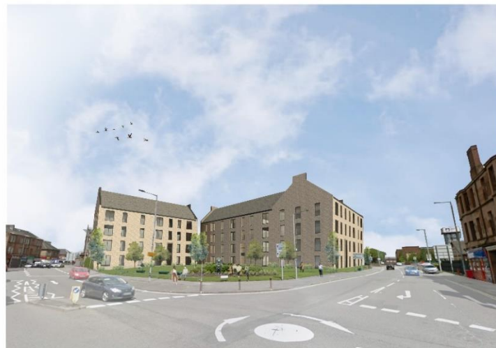
Figure 2. 3D image of North Lanarkshire Council's social housing project plan (© Coltart Earley Architects)

The project is due to begin construction in March 2023 and commission in May 2026.