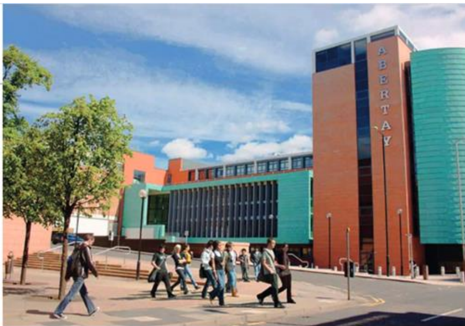
Figure 5. Abertay University Masterplan Vision

Project description: The feasibility and strategic business case set out the University Campus Masterplan, which has sustainability, low and net zero carbon as its primary driver. Full implementation of the scheme will secure a net zero carbon and sustainable future for the university, providing the facilities that students and staff require, underpinned by an efficient and resilient heat network. The masterplan prioritises a new Energy Centre. The Campus strategy embraces multi-mode energy systems which will combine renewable sources with the primary sewer and air source heat pump solution. The Energy Centre will distribute the heat network to 7 buildings on the city centre Campus. The project is seeking funding and specialist technical support for the completion of a strategic business case.