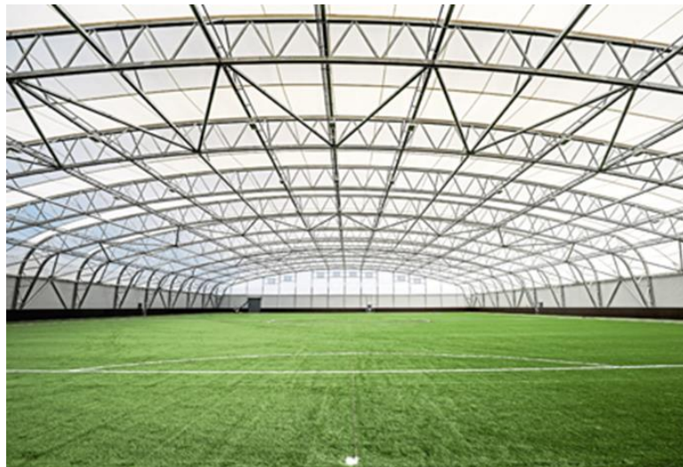
Figure 6. Regional Performance Centre, Dundee

Project description: The Caird Park project was originally supported by the Low Carbon Infrastructure Transition Programme. A pre-feasibility study to expand the network was published in January 2022 as part of an initiative to boost heat networks by the Scottish Cities Alliance. This study analysed opportunities to expand the existing network towards additional heating loads (a school, a college, a sports centre and a gymnastics centre). The project aims to deliver these expansions to their heat network.