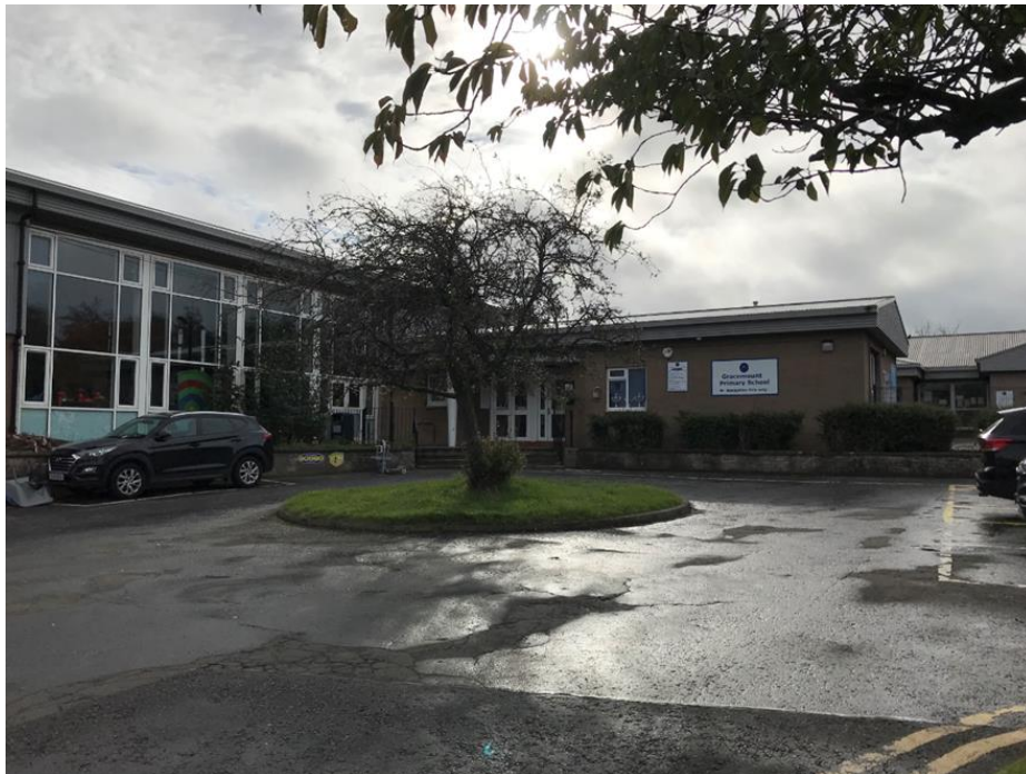
Figure 17. Gracemount Primary School

Network for public sector buildings including council-owned offices, an NHS health centre and an Edinburgh Leisure building in close proximity. The project proposes using both air source and ground source heat pumps to provide low carbon heat.