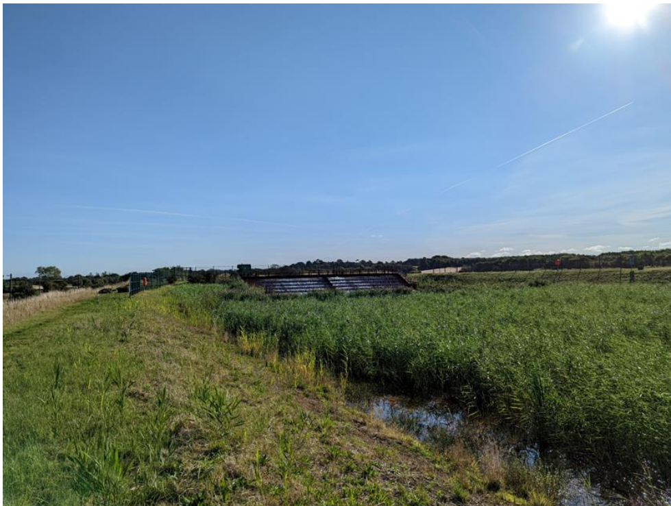
Figure 16. Water treatment reed bed lagoons at minewater site

The project involves a quarry and mine regeneration scheme creating new-build residential and commercial properties. A suggested approach is recovering heat from minewater which will be fed through an ambient loop to households each of which will have individual heat pumps.