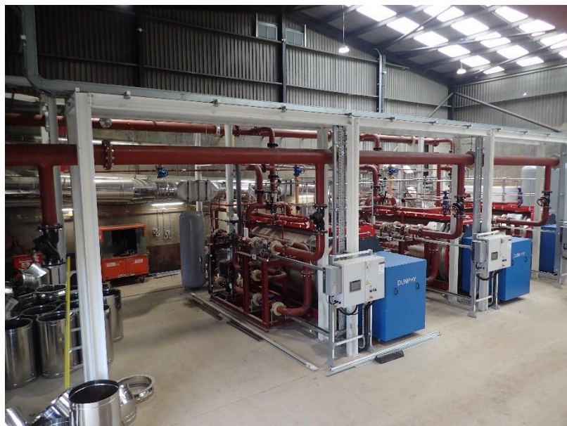
Figure 3. Torry Heat Network Energy Centre

The second phase is due to commission in March 2026.