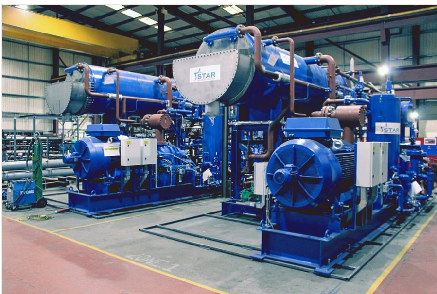
Figure 12. Queen's Quay Energy Centre

The project proposes the extension of the Queens Quay heat network to connect to the Golden Jubilee Hospital and hotel as well as nine of West Dunbartonshire Council's multiblock flats at Dalmuir and Littleholm (6 currently on electric, 3 on gas).