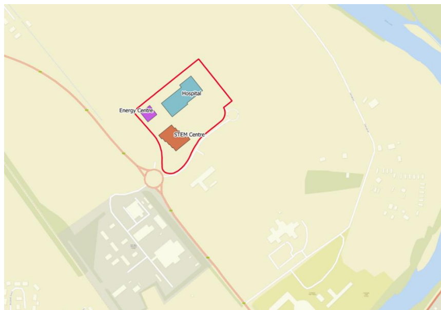
Figure 10. Proposed energy centre and connections locations

Proposed heat network to serve the Blar Mhor development site, including connections to the proposed STEM centre for UHI – West Highland College and NHS General Highland hospital. Air source and ground source heat pumps are being considered as heat supply technology.