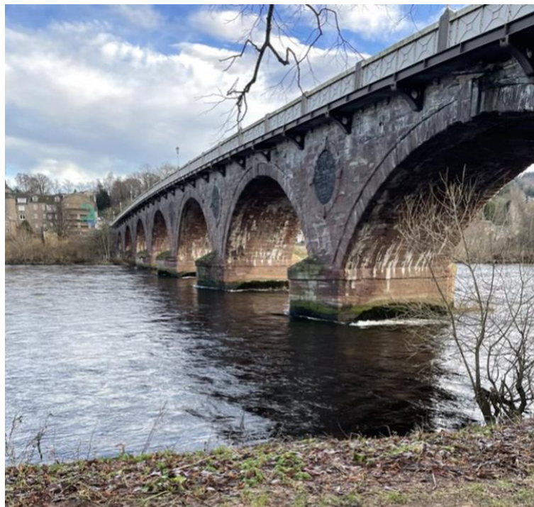
Figure 9. River Tay

Various non-domestic and domestic buildings including a concert hall, council offices, tower blocks and a hotel have been identified within Perth city centre that are potential connections for a heat network. A range of low carbon heat sources are recommended to be considered including river and ground source heat pumps.