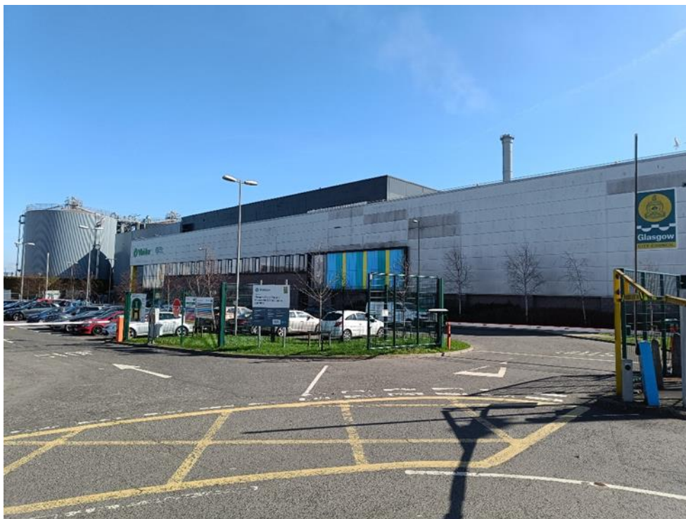
Figure 11. Glasgow Recycling and Renewable Energy Centre (GRREC)

Project secured grant funding to undertake a review of prior feasibility work to determine the potential for the Glasgow Recycling and Renewable Energy Centre (GRREC) to be used as a heat source for a district heat network serving a mix of domestic and non-domestic properties in the south side of Glasgow.