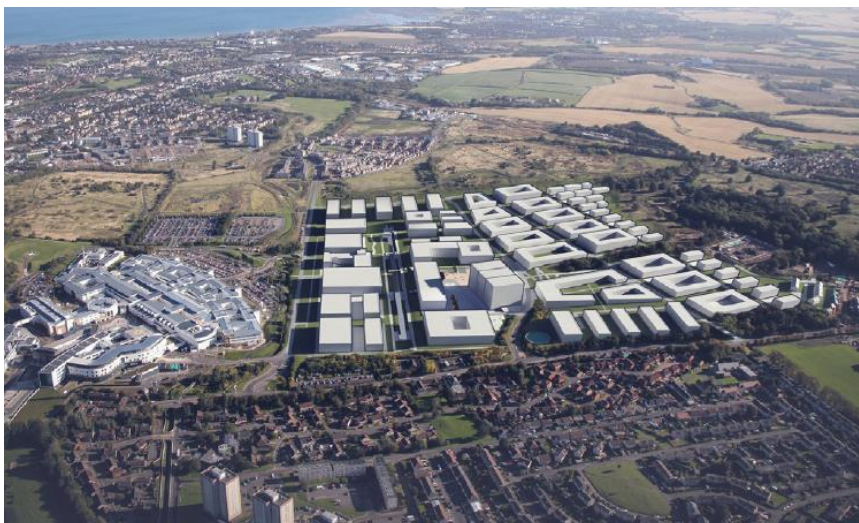
Figure 4. Aerial view of the Edinburgh BioQuarter site

The project explores the supply of heat to the Edinburgh BioQuarter site via a heat network. This is proposed to serve new buildings on Edinburgh's BioQuarter site masterplan, with connection to existing buildings on site in due course, including the NHS Royal Infirmary of Edinburgh and the Royal Hospital for Children and Young People, and the potential to serve social housing off-site. The feasibility study examines the potential for a new heat network or connection to the upcoming Shawfair Heat Network in Midlothian.