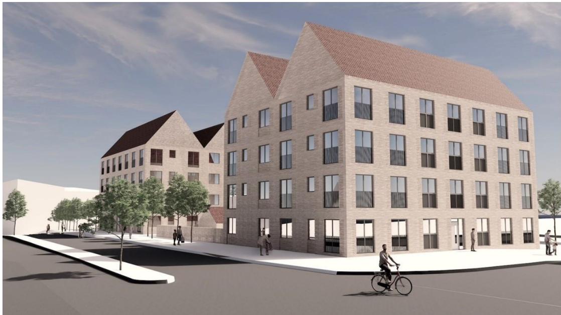
Figure 1. 3D Image of Lowther Homes affordable housing development plan (Credit: Collective Architecture)

The project is due to begin on site in March 2023 and complete in September 2024.