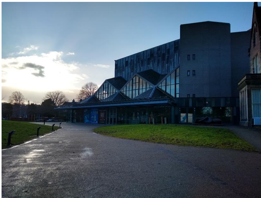
Figure 7. Eden Court and the Highland Council offices, Inverness (Credit: Buro Happold on behalf of Zero Waste Scotland)

Project description: The Highland Council are looking to establish district heating networks within Inverness. The main buildings identified for connection include Inverness Leisure Centre, Inverness Ice Centre, Highland Archive and Registration Centre, Inverness Botanic Gardens, Highland Council HQ and Eden Court.