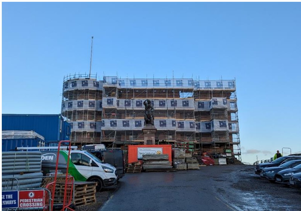
Figure 8. Inverness Castle

Highland Council are looking to develop a district heating network within the immediate area surrounding Inverness Castle which is a council administration centre. Potential heat sources include ground source heat pumps, river source heat pumps, sewer heat recovery, biomass and large scale air source heat pumps.