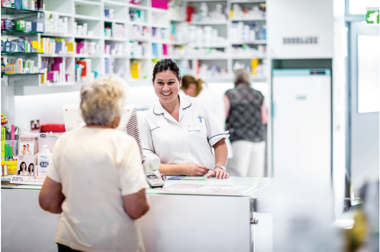
Community Pharmacy Team