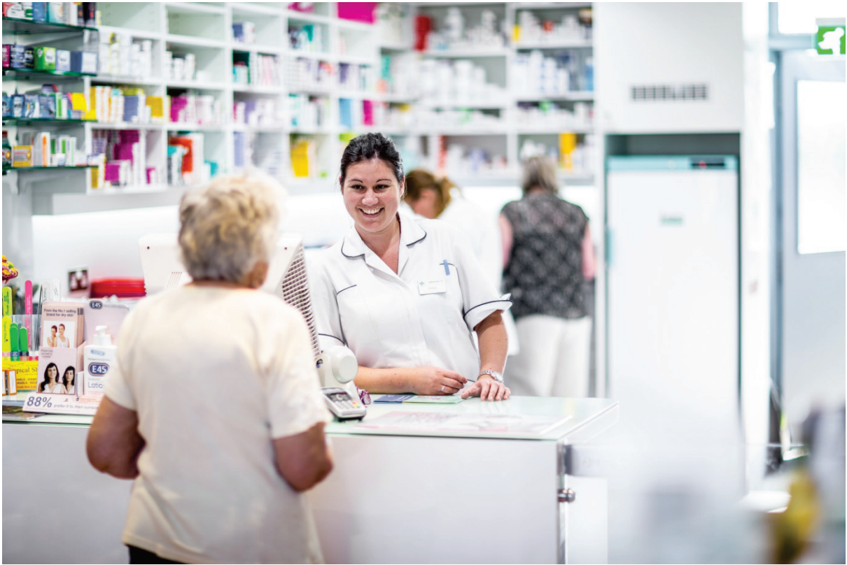
Community Pharmacy Team at work