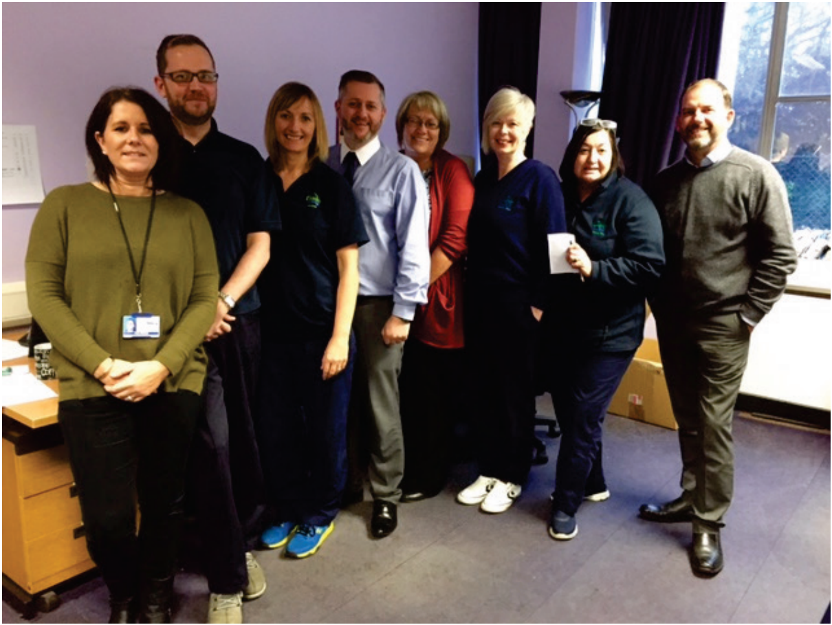
The Social Care Response Service, Dundee