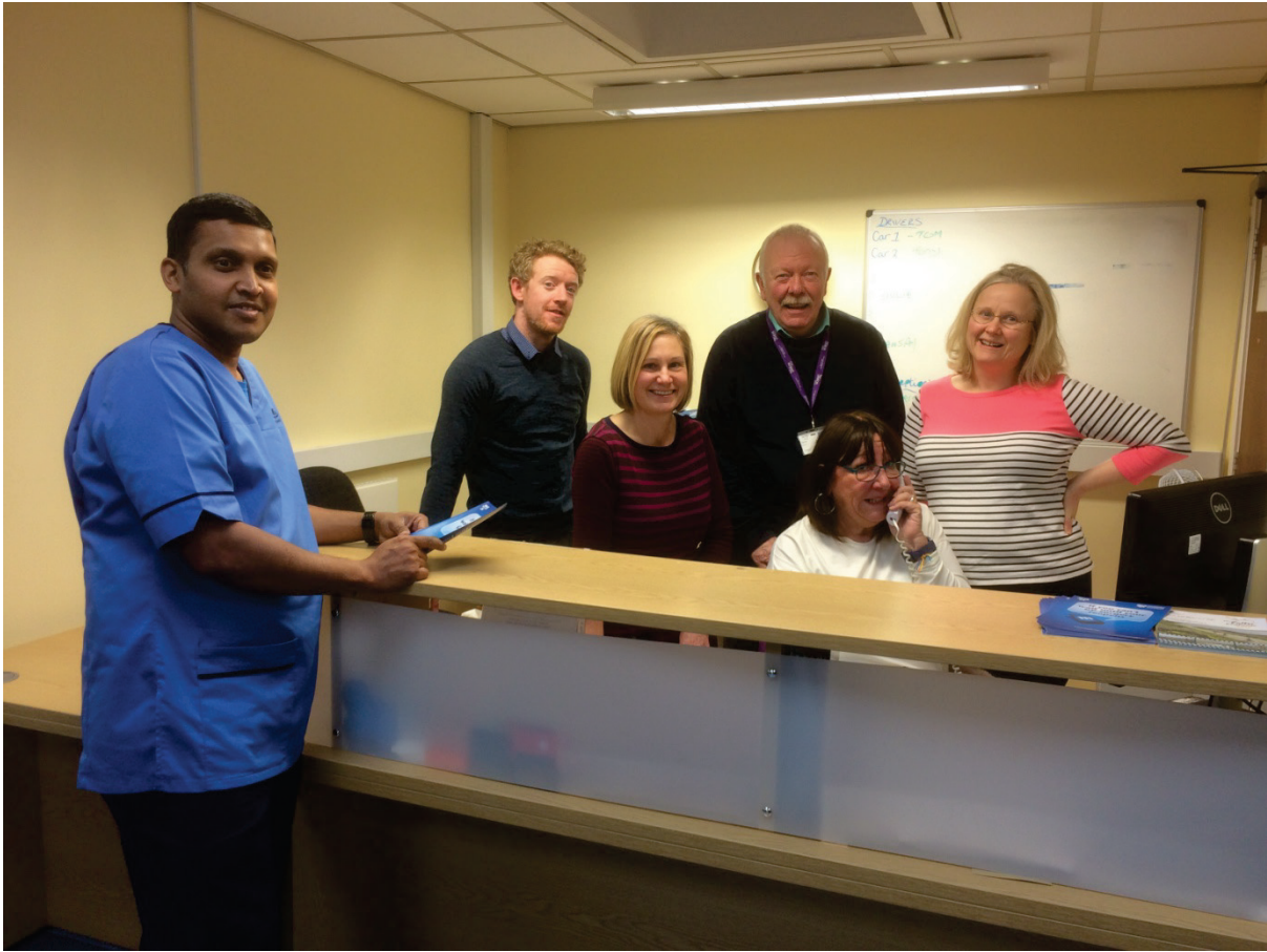
Primary care out of hours team at the Urgent Care Centre, Royal Victoria Hospital Edinburgh, including driver, GPs, nurse practitioner, receptionist and centre support staff