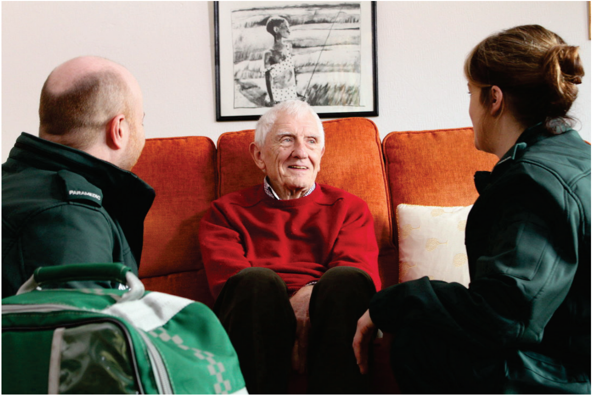
Scottish Ambulance Service taking care to the patient