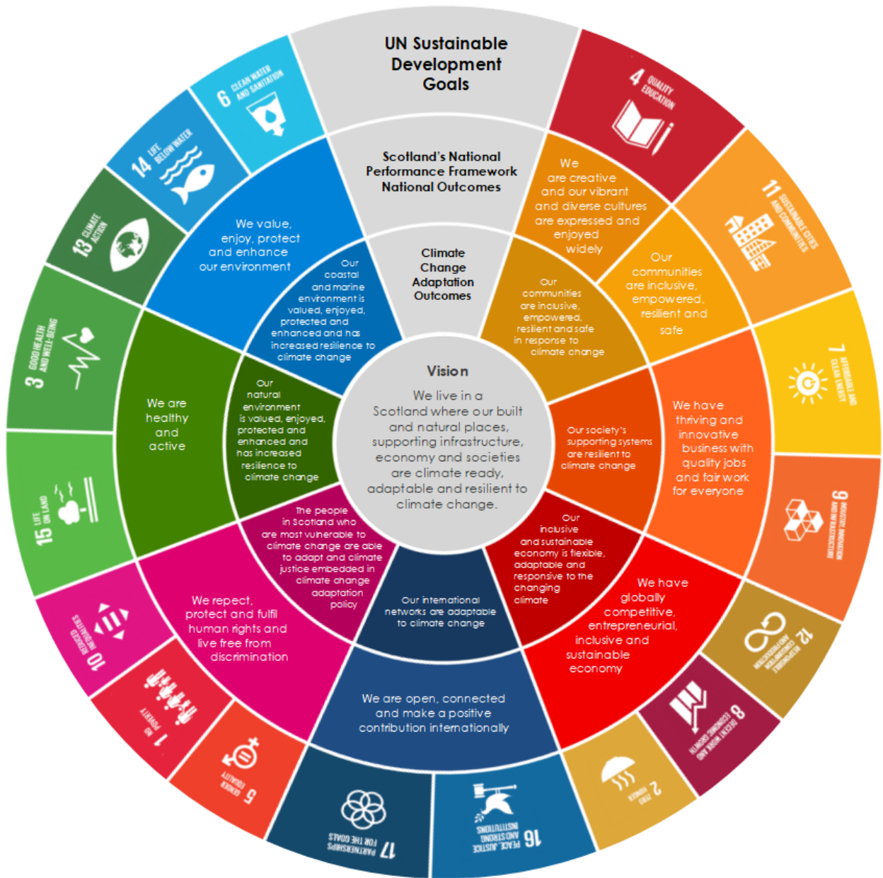
Figure 3 Structure and approach of the draft programme