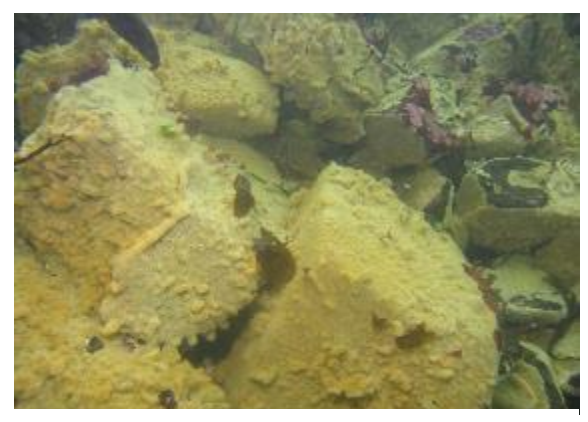
D. vexillum growing over boulders on the seabed.

Biosecurity planning is recognised as the best way to assist stakeholders to identify threats and mitigating actions which will lower their risk from invasive non-native species. Undertaking this planning activity at a regional scale helps to boost