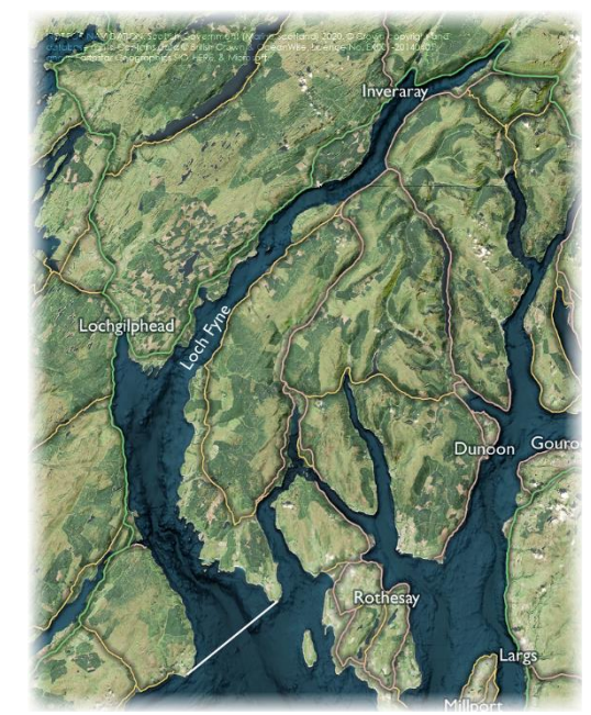
Figure 2 A map showing the approximate extent of the plan area.

The plan belongs to the stakeholders involved in its development as outlined on page 9. The actions outlined have been amalgamated to allow for useful biosecurity