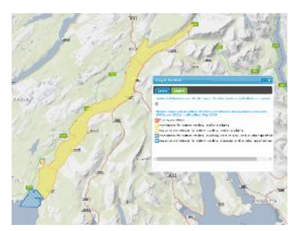
Figure 3 A map showing the marine protected areas in upper Loch Fyne

Fishing has declined significantly as a main activity on the loch in recent years. Aquaculture and leisure marine users now dominate as users of the Loch. The main hubs for marine activities are as follows: