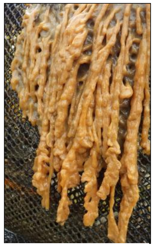
Pendulous growth form of D. vexillum from west coast of Scotland

Attempts to eradicate D. vexillum from the environment have been made in other parts of the UK and elsewhere in the world, unfortunately, despite extensive efforts, these have not been successful.