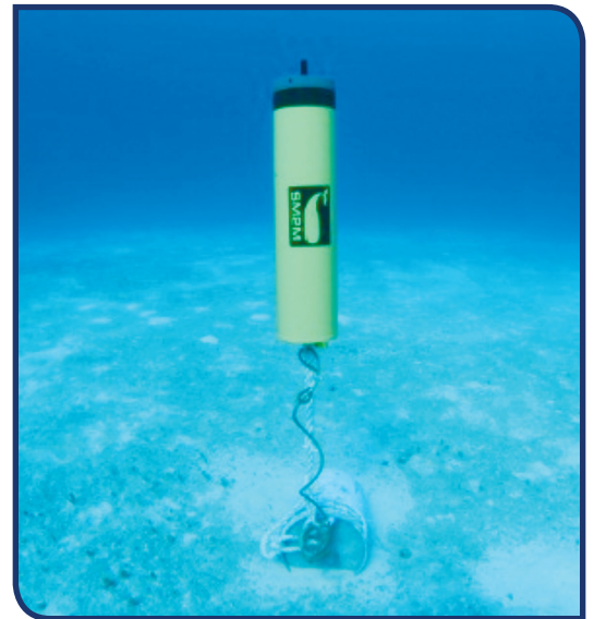
FIGURE 4. WILDLIFE ACOUSTICS' SM2M MARINE RECORDER WHICH RECORDS UNDERWATER SOUNDS