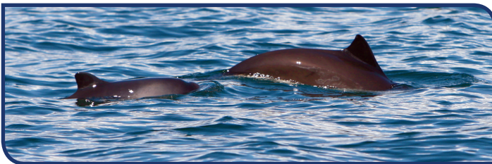
FIGURE 2. HARBOUR PORPOISE PHOCOENA PHOCOENA