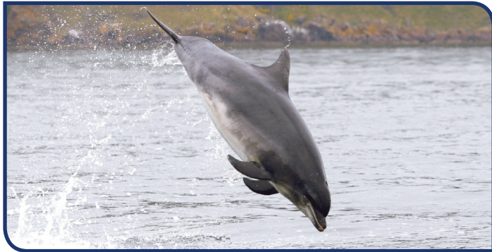
FIGURE 1. BOTTLENOSE DOLPHIN TURSIOPS TRUNCATUS