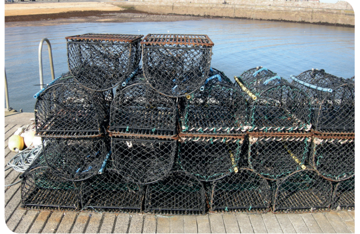
CREELS STACKED AT ANSTRUTHER HARBOUR