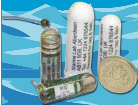
Selection of different tags used in tracking

Tracking devices have been developed by UK researchers to follow the movements of fish, sea mammals and turtles. For seals, mobile phone technology is used to transmit data back to researchers.