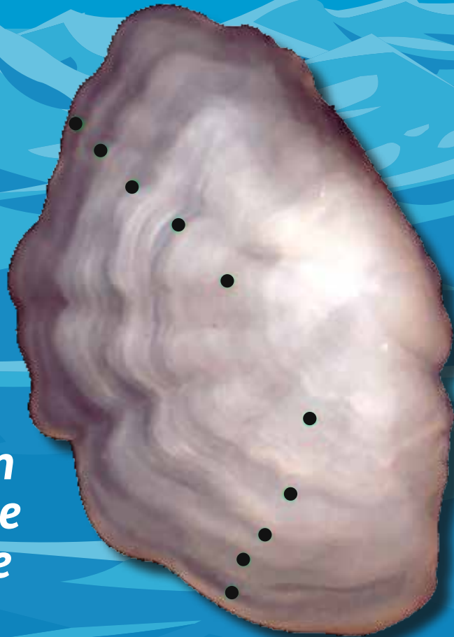
Angler fish ear bone (otolith), age 5

Fish have a bone in their ear called an otolith. Scientists can use growth rings in the otolith to tell the age of the fish.