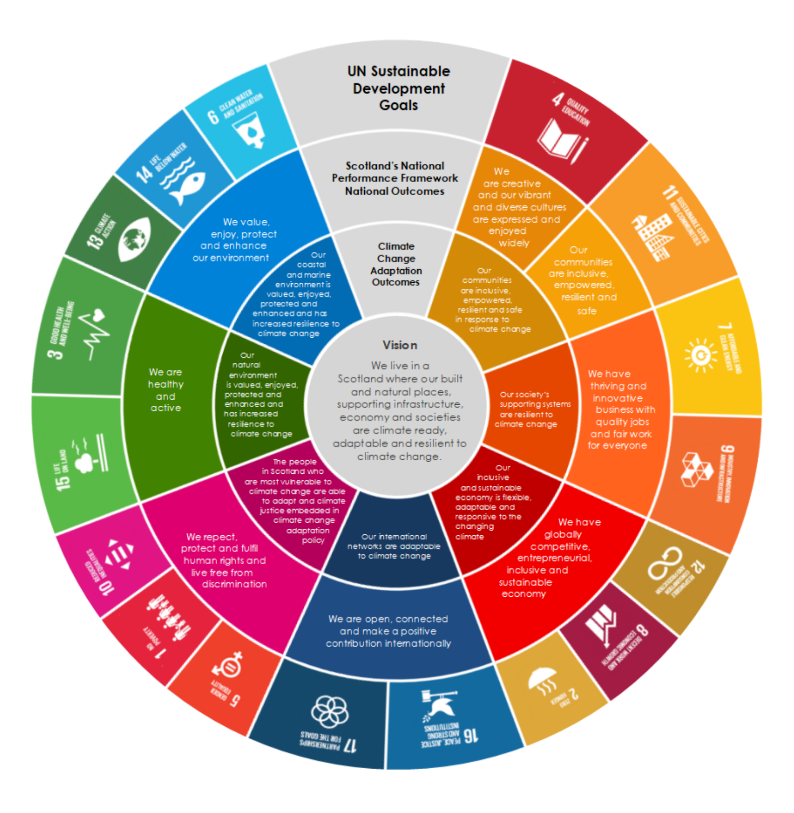
Diagram A: The Adaptation Programme's relationship to the UN Sustainable Development Goals and Scotland's National Performance Framework.