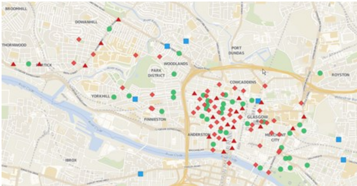
Figure 3 - Example of detailed traffic collection points, including turn counts, 12/24 traffic count locations and ANPR (data collected in Glasgow during winter 2017/18)

2.3.14 Local authorities will be responsible for the development of any traffic model that is deemed necessary for the assessment process. SEPA will work with the traffic modellers to ensure that the outputs are transferrable to assess local air quality issues in relation to modelled traffic changes.