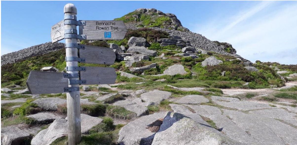
Figure 1 - Mither Tap hilltop fort