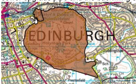
Holyrood Park scheduled area outlined in brown

Scheduled Monument Consent (SMC) is sought for upgrading a sewer near Waverley Park Terrace in Holyrood Park, Edinburgh. The sewer upgrade will be located at the bottom of the steps at Waverley Park Terrace, approx. 300m north from the base of Arthur’s Seat, in an area of parkland and trees known as the ‘Parade Ground’ The proposed works include the excavation of a sewer pipe trench, temporary access route for equipment via Spring Gardens, insertion of sewer upgrade pipe and the backfilling of trench and reinstatement of topsoil.