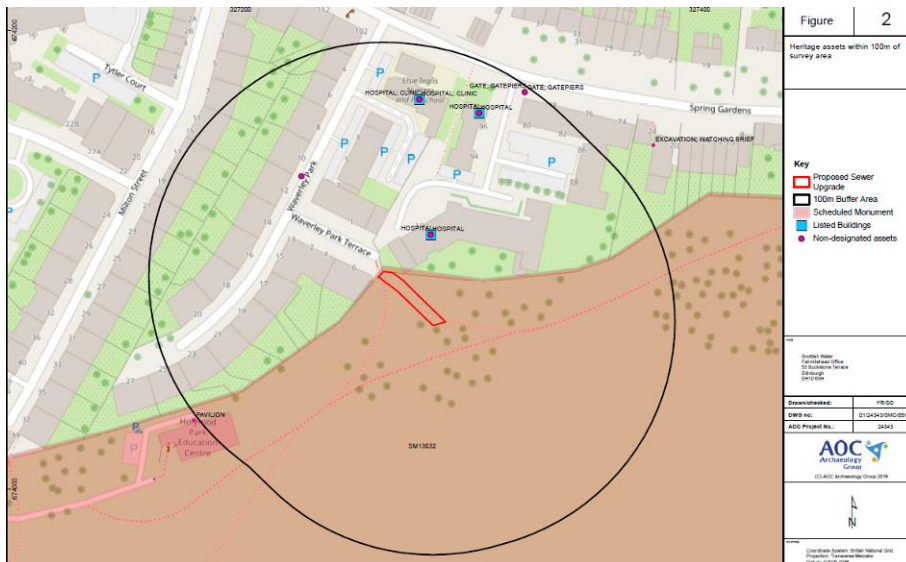
Location of proposed sewer works in Holyrood Park outlined in red (from project design)